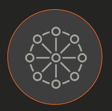
New Networks/ Distributed Ledgers