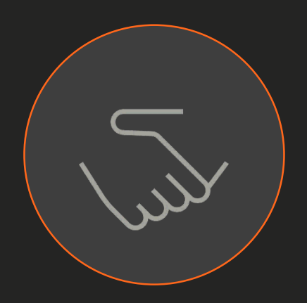
Collaboration Across FinTech